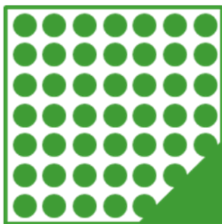
ORAFLEX® 11402 soft