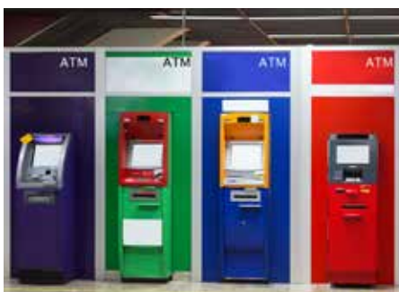
ATM / Vending Machines

The elastic qualities of the ORABOND® UHB Tapes enhance the inner strength of the tapes, allowing a high absorption capacity of dynamic forces, e.g. shock and impact.