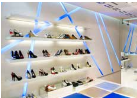
Interior Shop Fitting