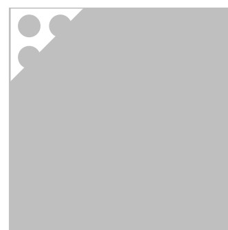
ORAFLEX® 11786 firm