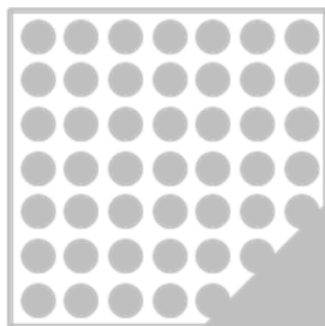
ORAFLEX® 11622 soft