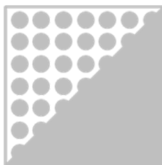
ORAFLEX® 11855 medium