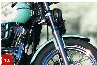
Example 10 ORACAL® 383

The RapidAir ®-Technology of the ORALITE® 5650RA material enables easy and quick application reducing the incidence of bubbles and creases, especially of large-sized applications.