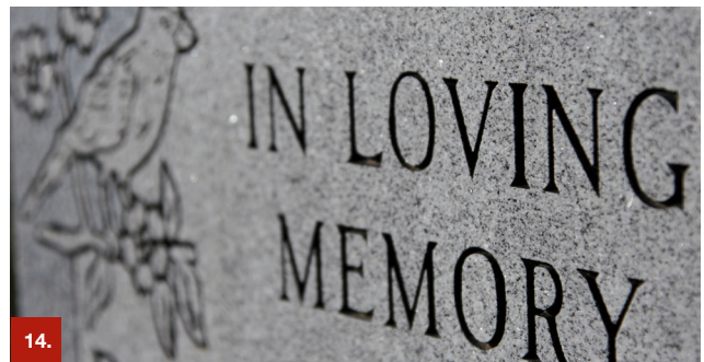
Example 14 ORAMASK® 831/832