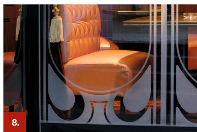
Example 8 ORACAL® 8810