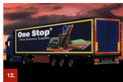
Example 12 ORALITE® 5600E