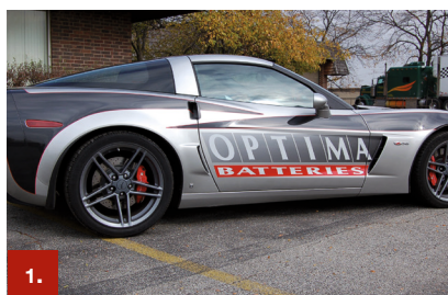
Example 1 ORACAL® 951

Designed for short and medium-term applications, this CAD/CAM vinyl can be used both indoors and outdoors. Its versatility and a range of 59 vivid colours with glossy finish and 56 colours in a matt finish makes it a perfect match for a wide range of decorative works. It displays an excellent degree of opaqueness and comes with a permanent solvent polyacrylate adhesive to allow for an outdoor durability of up to 5 years.