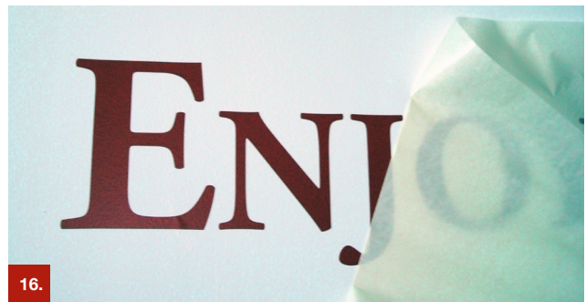
Example 16 ORATAPE® LT52