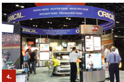
Example 4 ORACAL® 631

This plotter film is constructed specifically for use on banners, ribbons and other flexible surfaces. It adapts well to any surface, remains stable even under demanding conditions and may be easily removed without any trace. Possibilities are endless with a colour range of no less than 23 standard options.