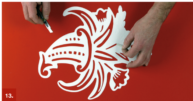
Example 13 ORAMASK® 810

These special purpose PVC films which are 230 and 350 micron thick are designed for a wide range of applications in stonemasonry and artistic sandblasting studios. They are ideal for sandblasting of glass, plastics and wood.