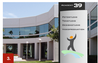
Example 3 ORACAL® 551