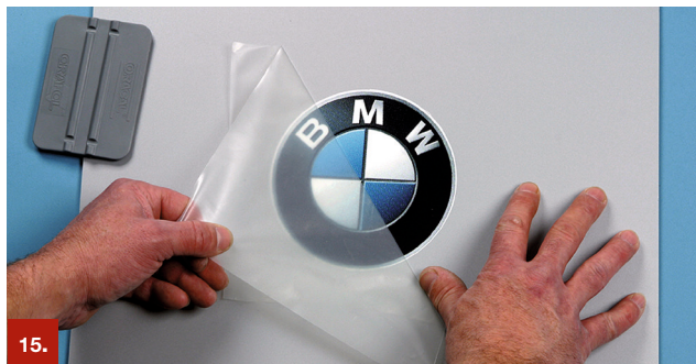
Example 15 ORATAPE® MT95

ORAFOL has developed application materials for a great variety of demands and uses.