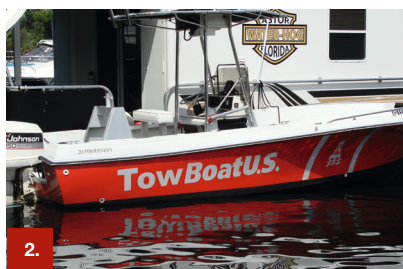
Example 2 ORACAL® 751C