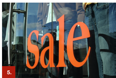
Example 5 ORACAL® 641