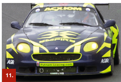
Example 11 ORACAL® 7510