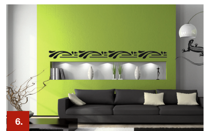
Example 6 ORACAL® 638