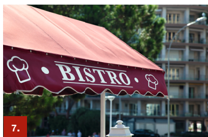
Example 7 ORACAL® 451

This UV-stabilised, transparently dyed, gloss special-purpose film boasts a performance of up to 5 years. It is perfect for high-quality illuminated signs and to decorate back-lit glass surfaces. The material is available in 32 vivid transparent colours, which can be superimposed to obtain fine nuances of colour, making the creative possibilities virtually unlimited.