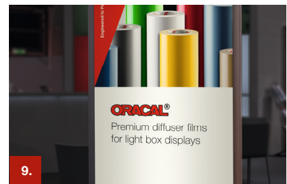
Example 9 ORACAL® 8830