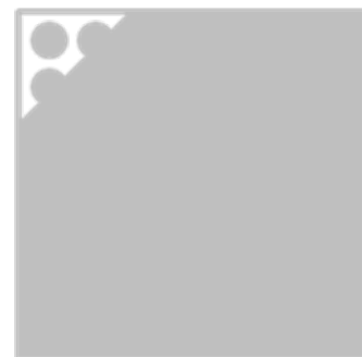
ORAFLEX® 11885 firm