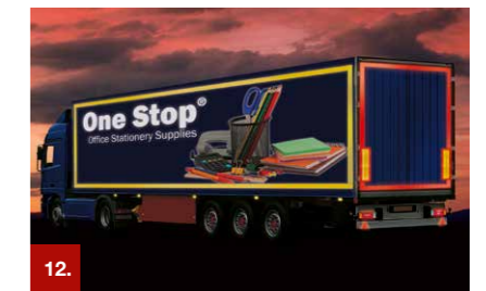
Example 12 ORACAL® 5600E