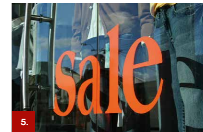
Example 5 ORACAL® 641