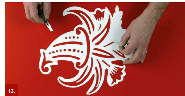
Example 13 ORAMASK® 810

These special purpose PVC films which are 230 and 350 micron thick are designed for a wide range of applications in stonemasonry and artistic sandblasting studios. They are ideal for sandblasting of glass, plastics and wood.