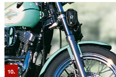
Example 10 ORACAL® 7510

The RapidAir®-Technology of the ORALITE® 5650RA material enables easy and quick application reducing the incidence of bubbles and creases, especially of large-sized applications.