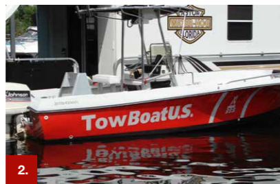
Example 2 ORACAL® 751C