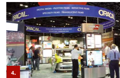
Example 4 ORACAL® 631

This plotter film is constructed specifically for use on banners, ribbons and other flexible surfaces. It adapts well to any surface, remains stable even under demanding conditions and may be easily removed without any trace. Possibilities are endless with a colour range of no less than 23 standard options.