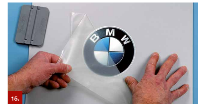
Example 15 ORATAPE® MT95

Reliable application tapes are required when computer-cut films are to be professionally and quickly applied. ORAFOL has developed application materials for a great variety of demands and uses.