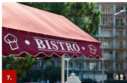
Example 7 ORACAL® 451

This UV-stabilised, transparently dyed, gloss special-purpose film boasts a performance of up to 5 years. It is perfect for high-quality illuminated signs and to decorate back-lit glass surfaces. The material is available in 32 vivid transparent colours, which can be superimposed to obtain fine nuances of colour, making the creative possibilities virtually unlimited.