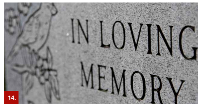
Example 14 ORAMASK® 831/832