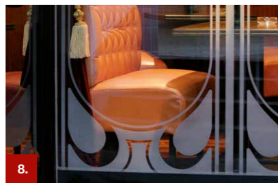
Example 8 ORACAL® 8810