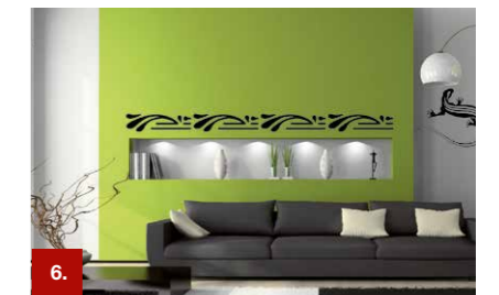
Example 6 ORACAL® 638