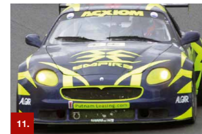
Example 11 ORACAL® 7510