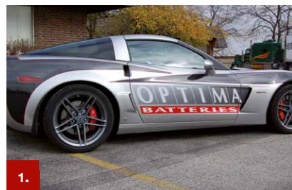
Example 1 ORACAL® 951

Designed for short and medium-term applications, this CAD/CAM vinyl can be used both indoors and outdoors. Its versatility and a range of 59 vivid colours with glossy finish and 56 colours in a matt finish makes it a perfect match for a wide range of decorative works. It displays an excellent degree of opaqueness and comes with a permanent solvent polyacrylate adhesive to allow for an outdoor durability of up to 5 years.