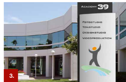
Example 3 ORACAL® 551