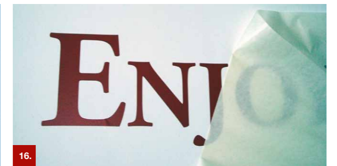
Example 16 ORATAPE® LT52