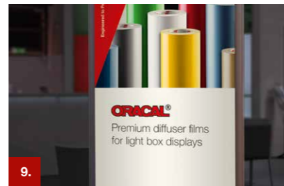
Example 9 ORACAL® 8830