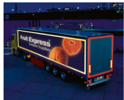
Application examples for ORALITE® VC 104+.