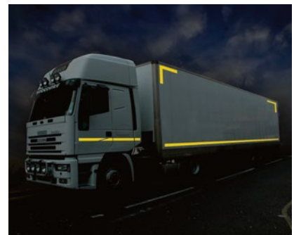
Application examples for ORALITE® VC 104+.