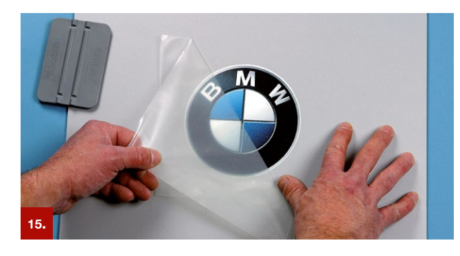
Example 15 ORATAPE® MT95

Reliable application tapes are required when computer-cut films are to be professionally and quickly applied. ORAFOL has developed application materials for a great variety of demands and uses.