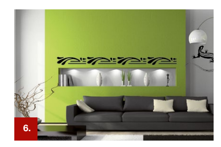
Example 6 ORACAL® 638