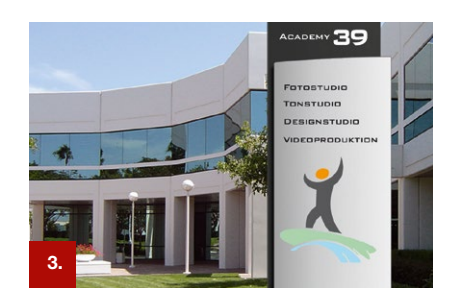
Example 3 ORACAL® 551