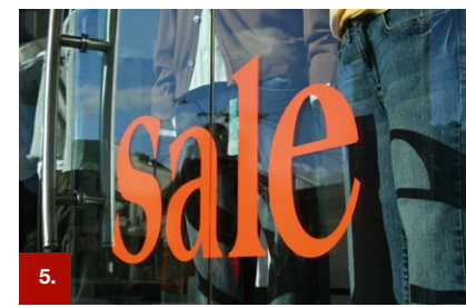
Example 5 ORACAL® 641