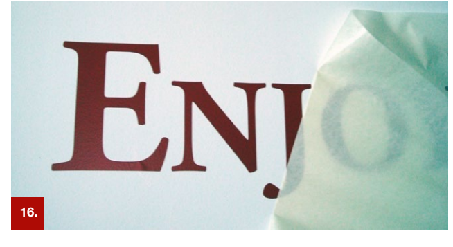
Example 16 ORATAPE® LT52