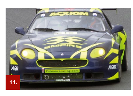
Example 11 ORACAL® 7510