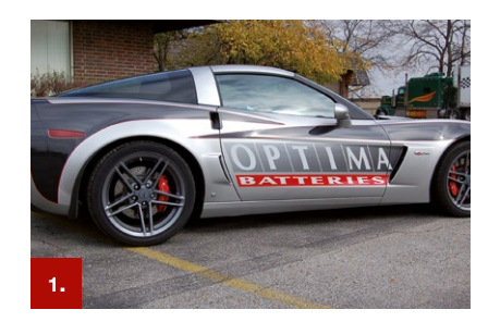
Example 1 ORACAL® 951

Designed for short and medium-term applications, this CAD/CAM vinyl can be used both indoors and outdoors. Its versatility and a range of 59 vivid colours with glossy finish and 56 colours in a matt finish makes it a perfect match for a wide range of decorative works. It displays an excellent degree of opaqueness and comes with a permanent solvent polyacrylate adhesive to allow for an outdoor durability of up to 5 years.