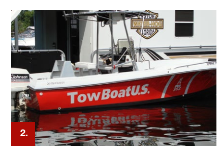
Example 2 ORACAL® 751C