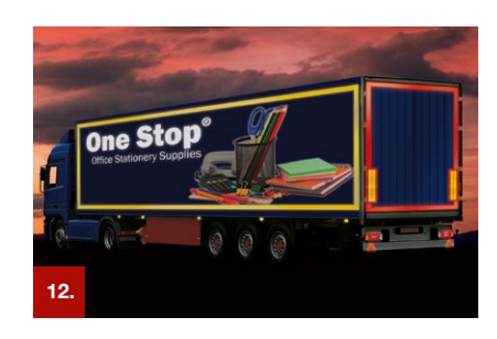
Example 12 ORACAL® 5600E